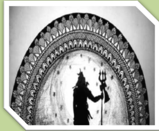
By Akshata V Badiger 3 rd Sem EEE AITM