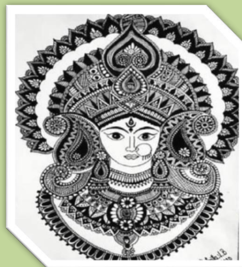
By Akshita V Badiger 3 rd Sem EEE AITM